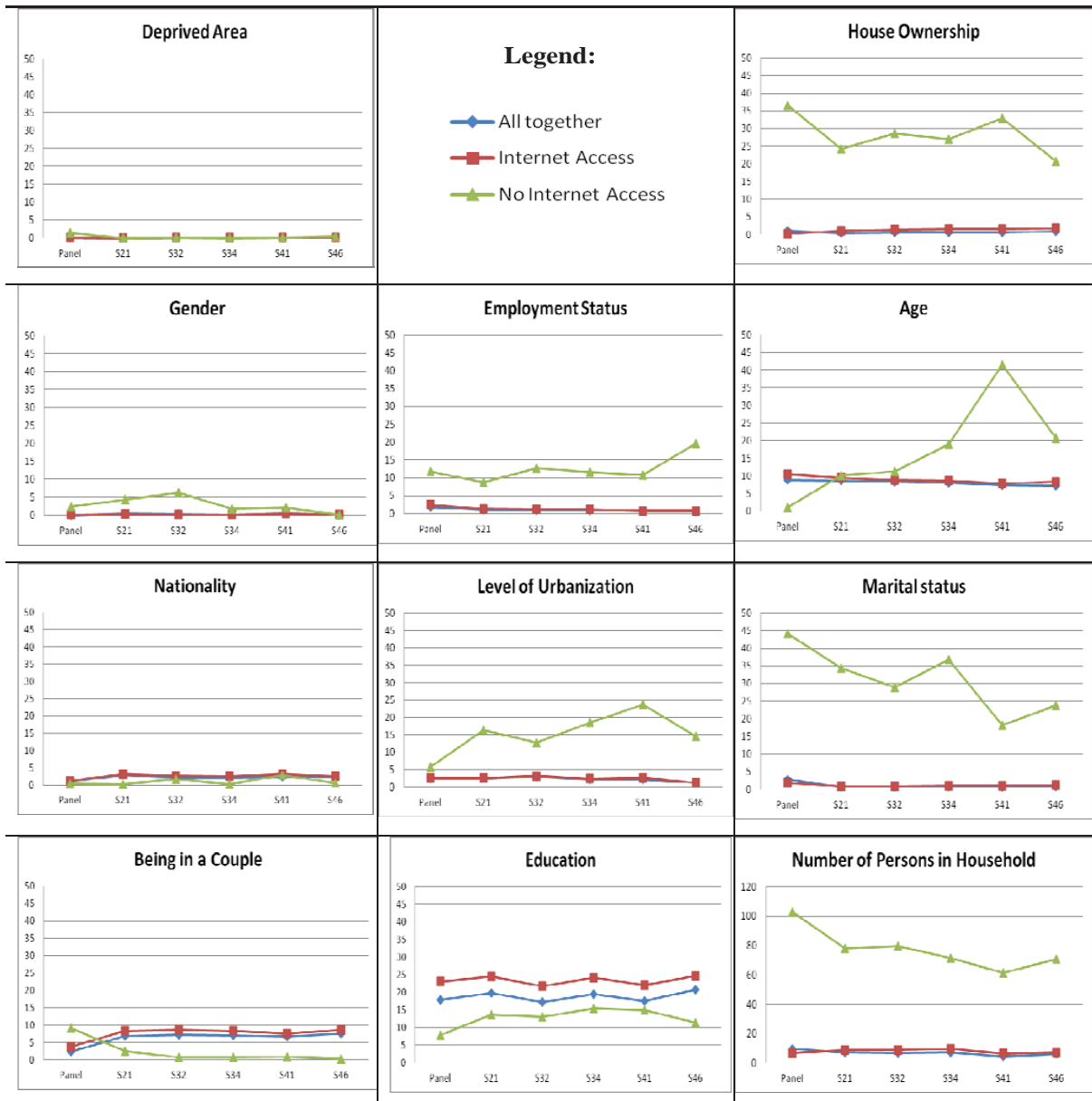
Figure 2: Distance of Chi-squared for the different variables and groups

Note: S21 to S46 correspond to different surveys (see Appendix 2)