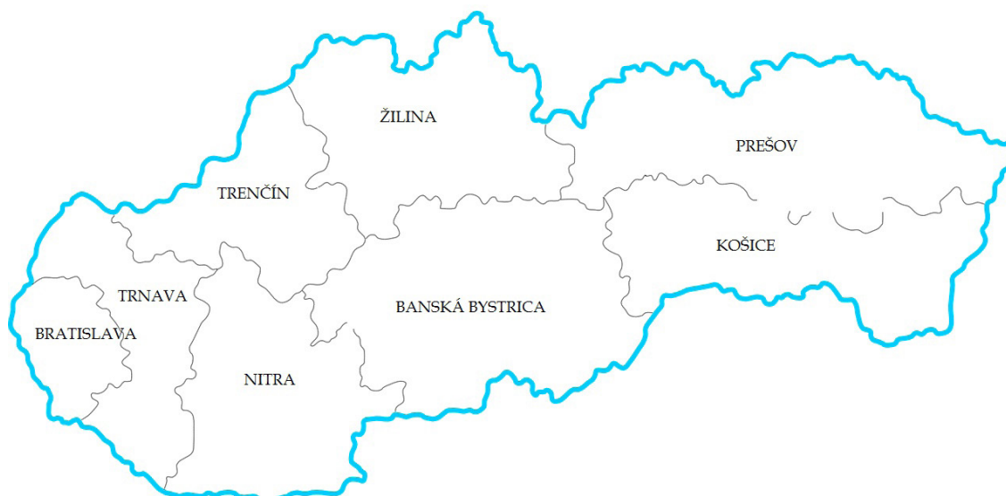
Figure 2: Regional division of Slovakia

Interestingly, only 803 people in Slovakia, a country of some 5.5 million inhabitants, rent their place or room through Airbnb (as of October 25, 2015). Prima facie , it is a strikingly low number given the fact that more than 290,000 people were actively searching employment in Slovakia 3 at that time and the combination of high rate of home ownership and unemployment. Furthermore, the Slovak government did not enact legislation or practical measures against the Airbnb service so far.